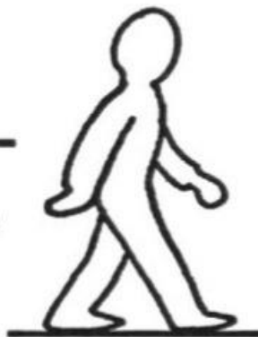
WALKING 2 Kings 4:35