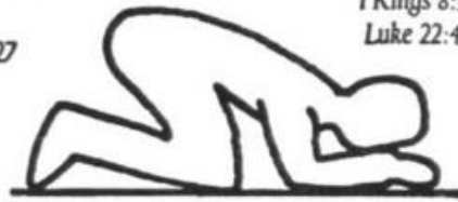
BOWING Exodus 34:8; Nehemiah 8:6; Psalm 72:11