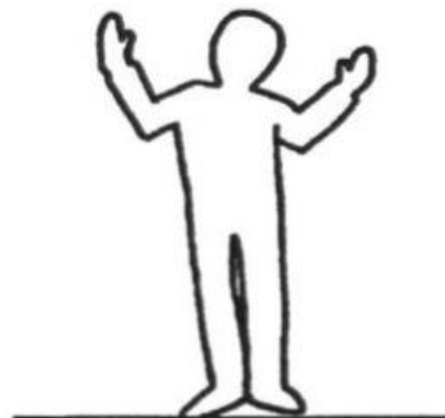
WITH UPLIFTED HANDS 2 Chronicles 6:12,13; Psalm 63:4; 1 Timothy 2:8