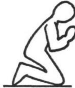
KNEELING 1 Kings 8:54; Ezra 9:5; Luke 22:41; Acts 9:40