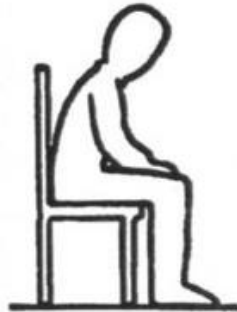
SITTING 1 Chronicles 17:16-27